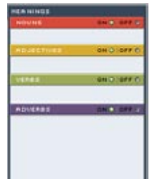
*Meanings List with color-coded Parts of Speech

Which parts show more connections than others (for example, do you get lots of adjective and adverbs, but no nouns or verbs)?